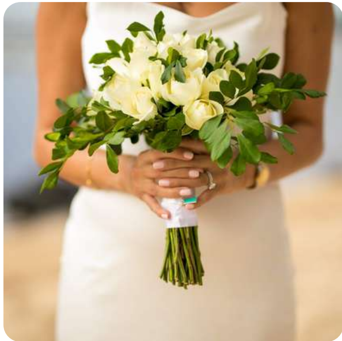
🌸 Bridal bouquet: 70 – 90 €

We will send you our collection so you can choose the bouquet you like the most!